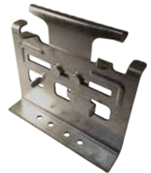
Super Tall SS360 Clip 2 ½" Standoff

Critical Dates: The new product offering is now available and will be included in eQuote February 6, 2018. Contact your local Sales Representative for more information.