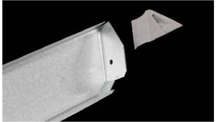
Current Outside Metal Closure with Required Foam Closure