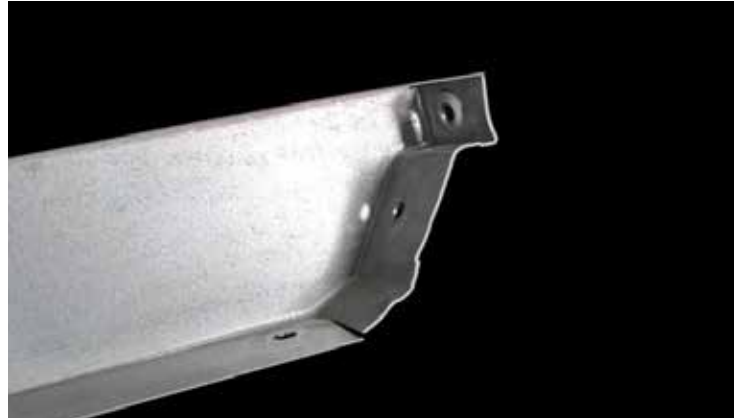
New Outside Metal Closure

Effective June 29, 2015, projects with SSII or SS360 outside closure requirements will be processed using the new and improved Outside Metal Closure. This closure eliminates the need for the foam closure. In addition, this closure will be used in conjunction with Lap Stiffeners in lieu of Ridge Support Flashing at Ridge, High Side Eave and High Side Roof to Wall Conditions. These changes improve weather tightness and provide a more erector friendly installation.